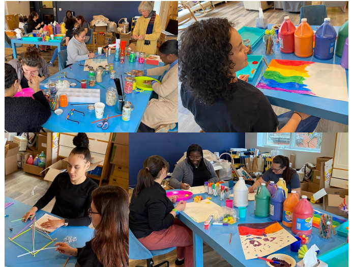
TAP Cohort 4: Week 1

Our community and parent outreach is growing with us. We are hosting parent groups in Poughkeepsie and are finalizing plans to offer additional groups in English and Spanish in multiple Dutchess County locations. We are widening our outreach with a revamped website complete with English & Spanish options and the relaunch of the DAY ONE Podcast.